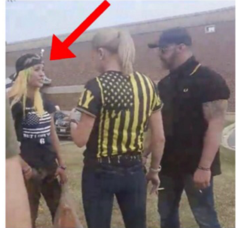
Cahill coordinating and socializing with Proud Boys