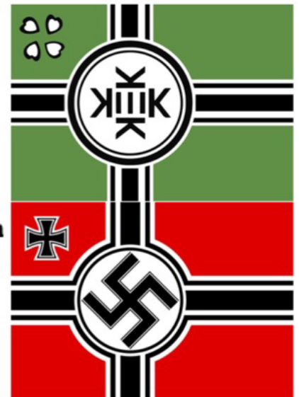
Imagery showing how the Kekistan flag is based on the Nazi Battle flag